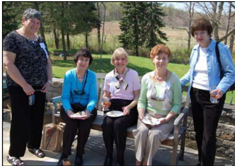
Members of the Class of 1969 at the MSM President's Tea for SJC Alumnae