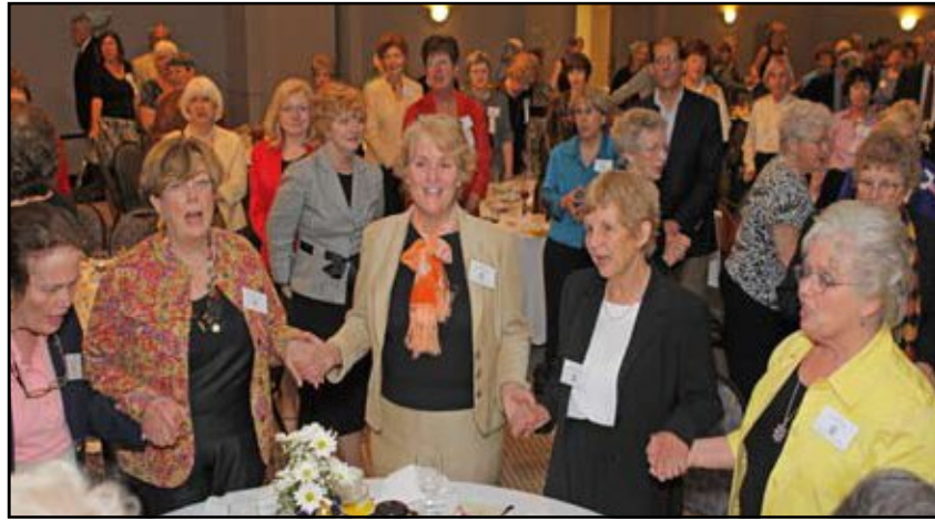
Members of the Class of 1963 join in singing the Alma Mater at the conclusion of the banquet.